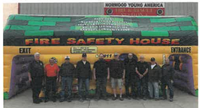
The NYA Fire Department's Inflatable Safety House will be able to be set up at schools and community events. Special thanks to the VFW and Legion for their financial support!