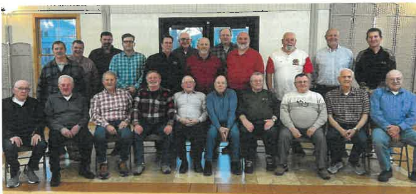
Honorary Retired members of the NYA Fire Department. These are members who retired with 20 or more years of service on the department.

As we celebrate another Thanksgiving season, we will continue to focus on making this community better and stronger. Thank you for taking care of your family and your neighbors! Together, we can continue our good work because Norwood Young America is more than a place, it's our home! And we are so proud to say we live here!