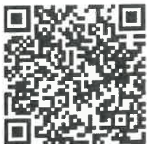
Highway 51 Bongards

At our last Council meeting, a preliminary budget was adopted for 2024. For the past two years, the Council purposefully set a budget that plans for future growth in a fiscally responsible manner. Norwood Young America is more than a place; it is our home, and we will continue to prepare for the best home possible with our budgeting and projects!