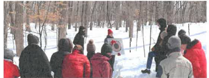
PUBLIC PROGRAMS • GROUP RECREATION