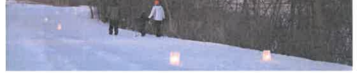
CANDLELIT NIGHTS AT BAYLOR • FEBRUARY 15 & 22, 2025 * if there is not sufficient snow for skiing, the event will be a luminary walk.