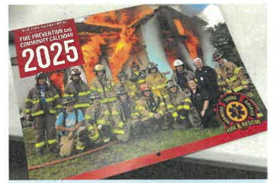
The NYA FD 2025 calendars are available at City Hall if you did not receive one. Thank you, NYA FD, for the valuable info, important dates, and coupons from local business supporters!