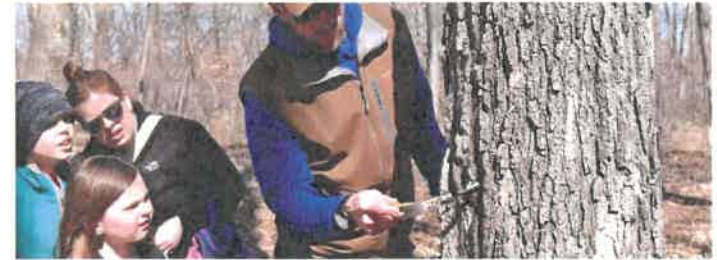
MAPLE SYRUP FESTIVAL • MARCH 22, 2025